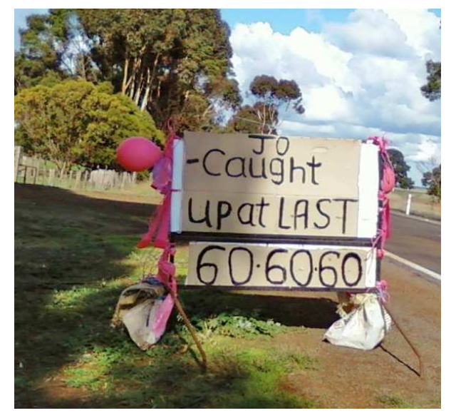
The sign says it all.

Macarthur Advancement & Development Association Inc. Issue Nº 141 JUNE 2010